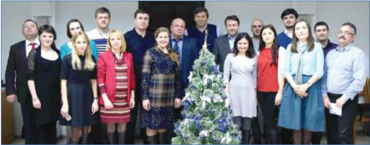
A New Year, a New beginning