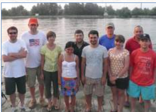
The Danube Delta. IDIS “Viitorul” – team building process