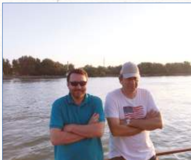
Conversations with Danube accents