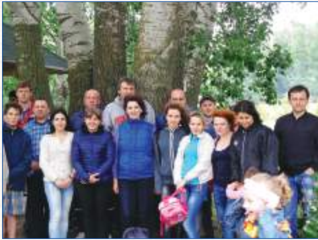
A moment of respite at Costesti