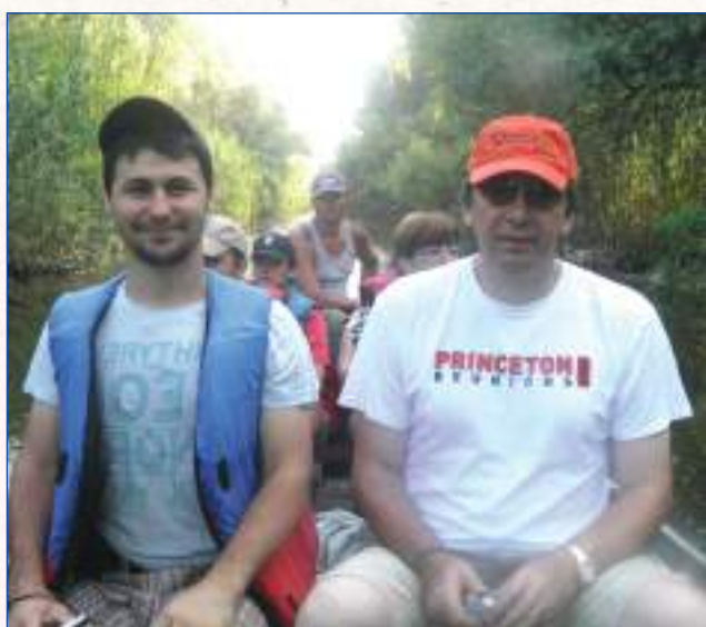
On a special mission