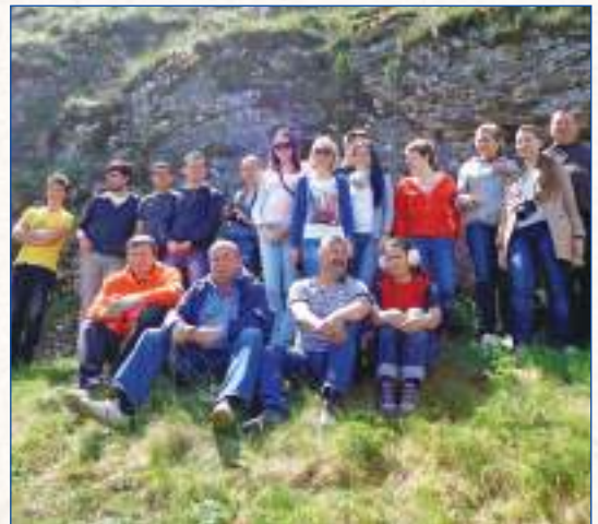
IDIS "Viitorul" team and the millennial rocks