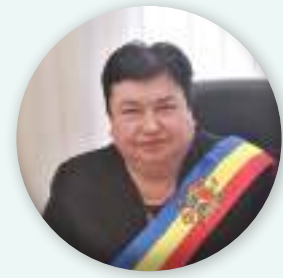
Nina COSTIUC mayor of Budești, Chisinau municipality