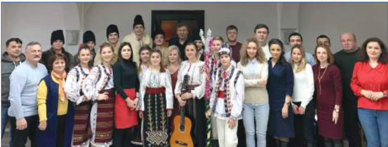
IDIS "Viitorul" team and the famous carolers from Budești