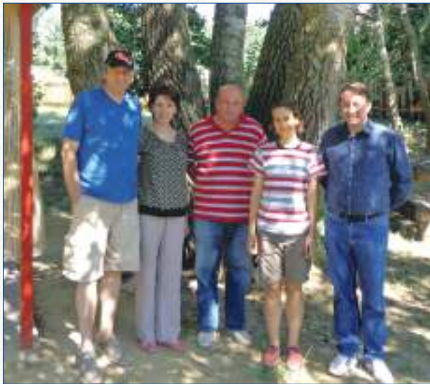
Return to "Sapte frati"