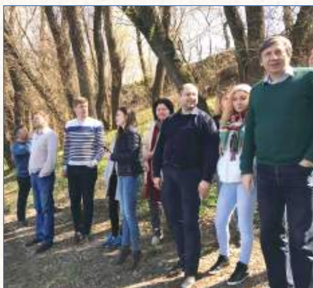
In the spring, ideas are refreshed