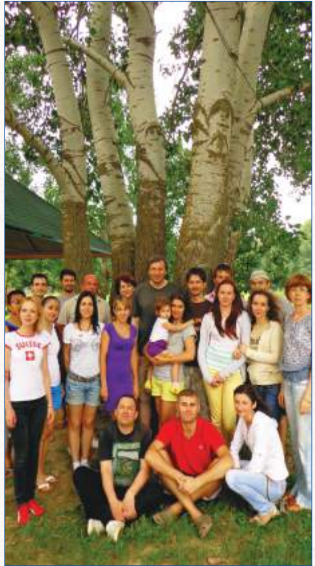
Time spent wisely is not wasted