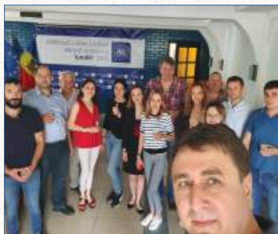
Together the goals are clearer