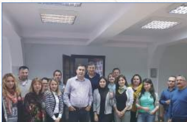
Moment of reflection