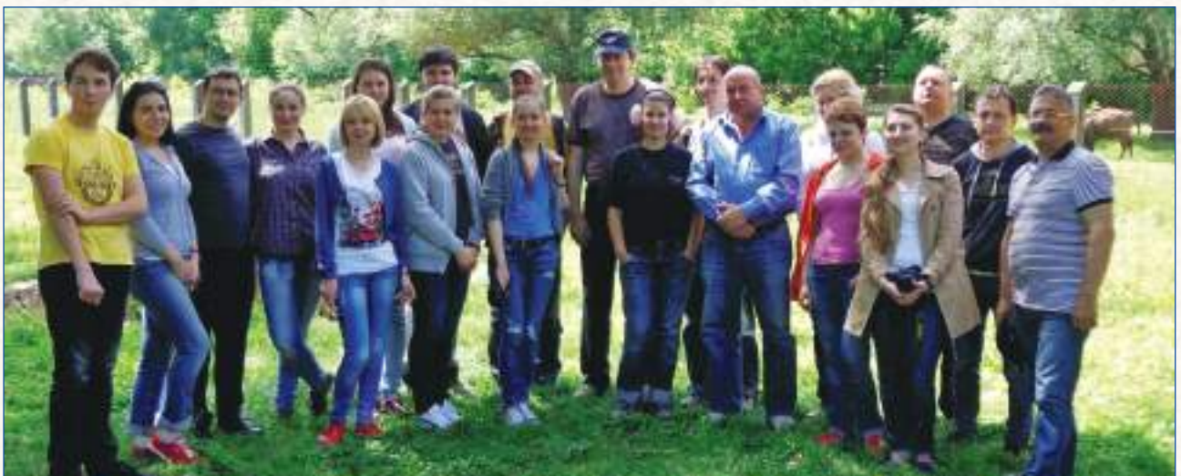
Energy, effort, passion, talent, tenacity, resilience go together with good mood