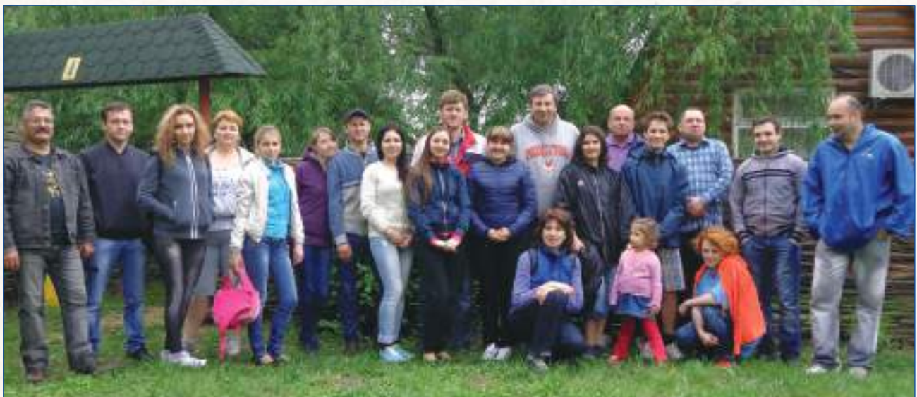
IDIS "Viitorul" team is recharging its batteries