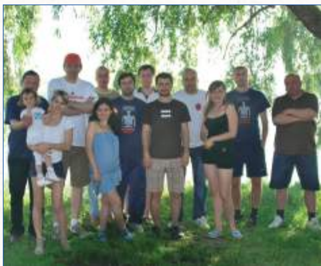
The impossible can always be divided into possibilities on the banks of the Costesti pond