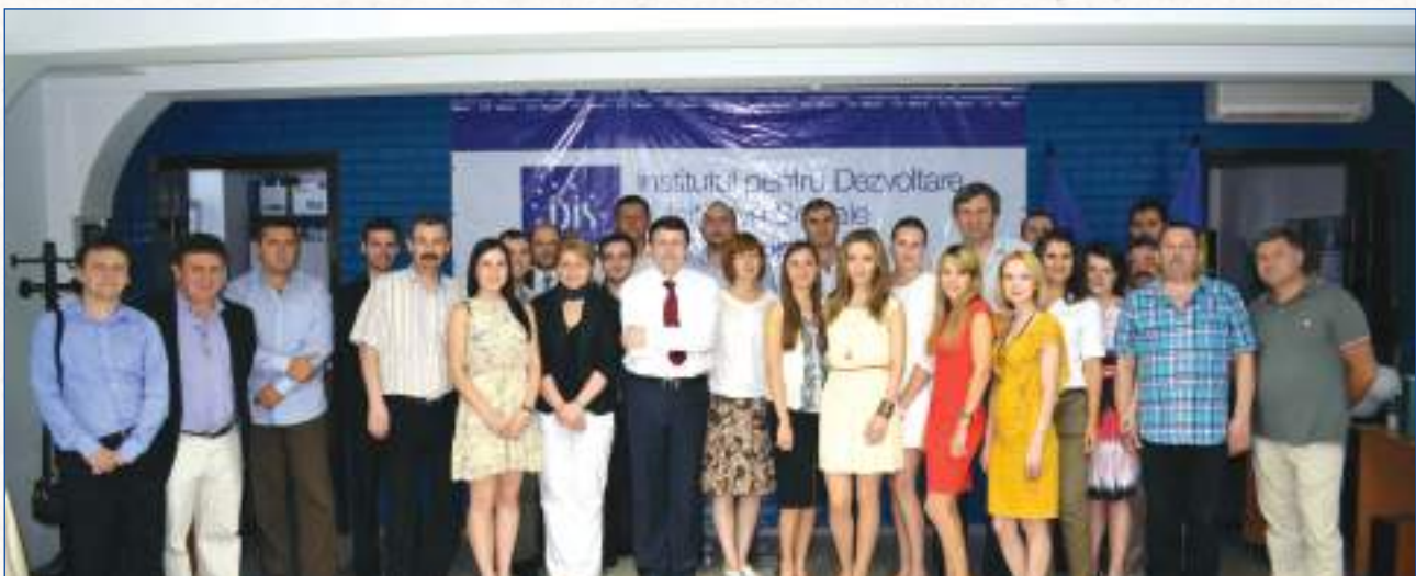
IDIS "Viitorul" Team Meeting. Nothing is worth more than today