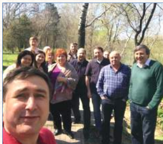
If you want to innovate you need collaboration