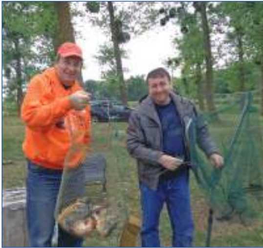
Sometimes effective cooperation with fish is achieved