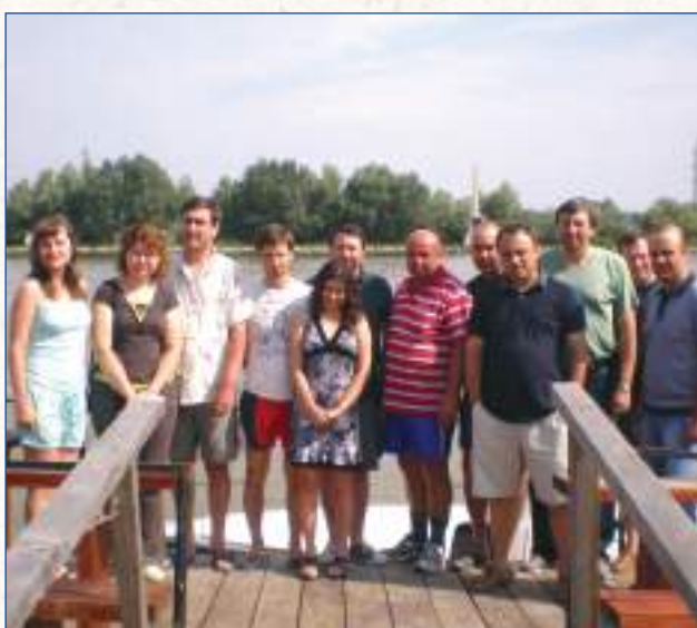
Working in a team is the secret that makes ordinary people achieve extraordinary results