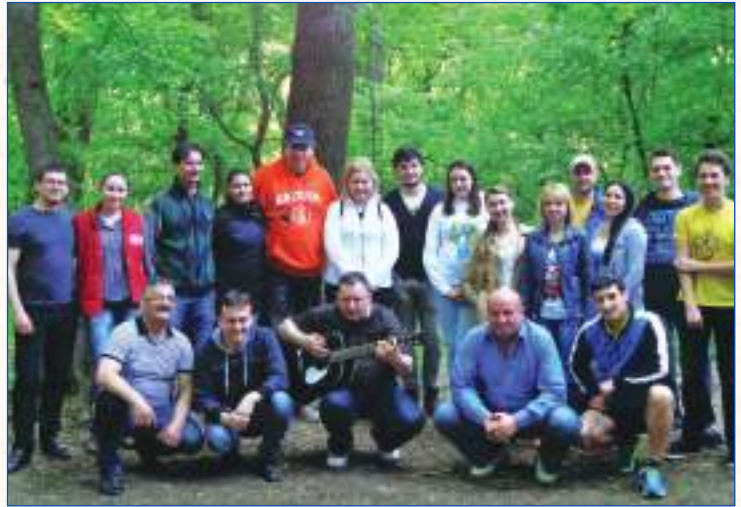
In the heart of the woods, close to the bison