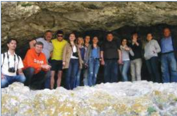
IDIS "Viitorul" team and the millennial rocks