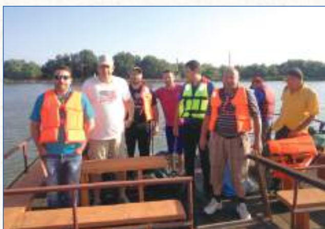
Preparation for large-scale fishing in the Danube